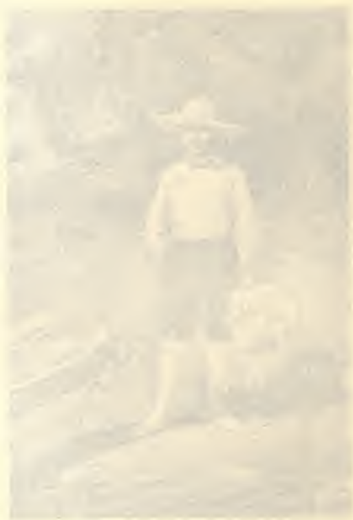
The Barefoot Boy